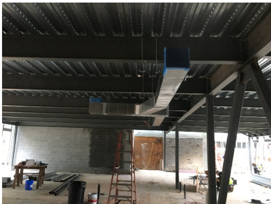
Ductwork Installation at New Addition