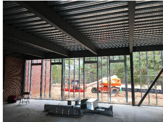
West Elevation Framing at New Addition