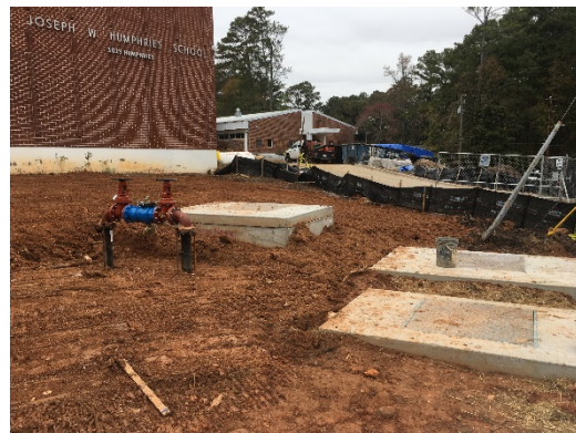
New Water Vault Installation