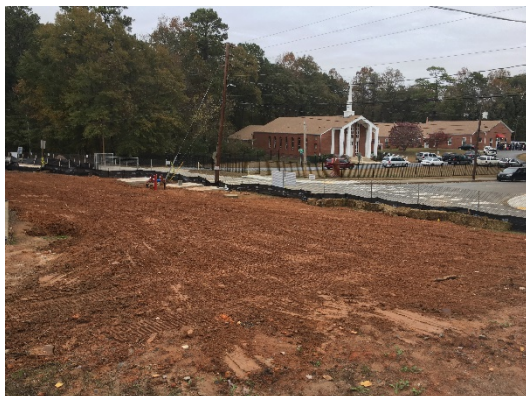
East Elevation Final Grading