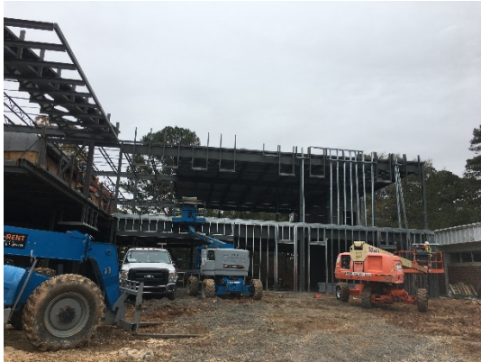
Exterior Framing at New Addition